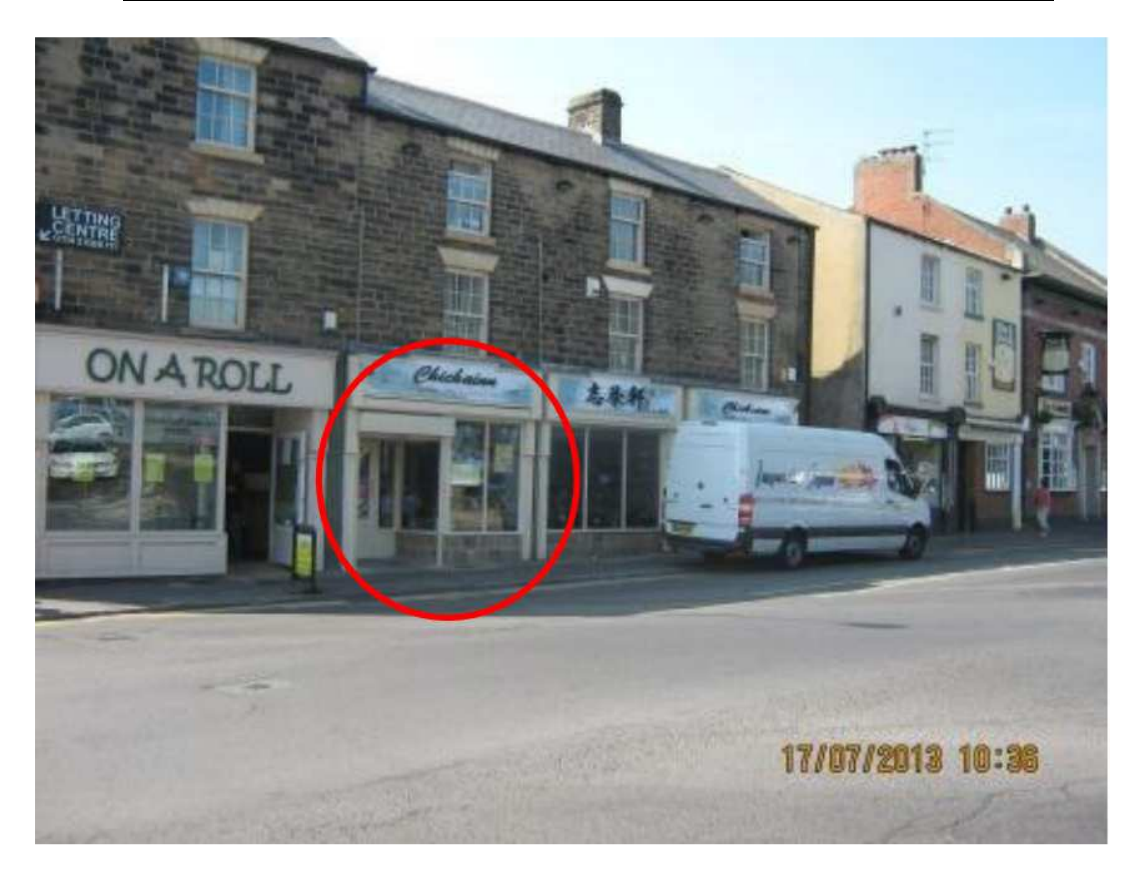
Photograph 1 showing the roller shutter in the open position.

3.6 The photographs, below, show the property in question and demonstrate the visual harm is unacceptable in this area.